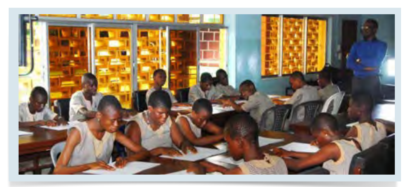
Students of Pacelli School for the blind, Surulere - beneficiary of the Children's Day initiative 2013

Orange Volunteers Programme: This is a programme by GTBank staff, Staff volunteer to provide extra classes for public school students within the community, in preparation for their external examinations. We coached the students of St. Georges Boys and Girls Primary School, for their entrance examination into secondary school and had a success record of 100% pass.