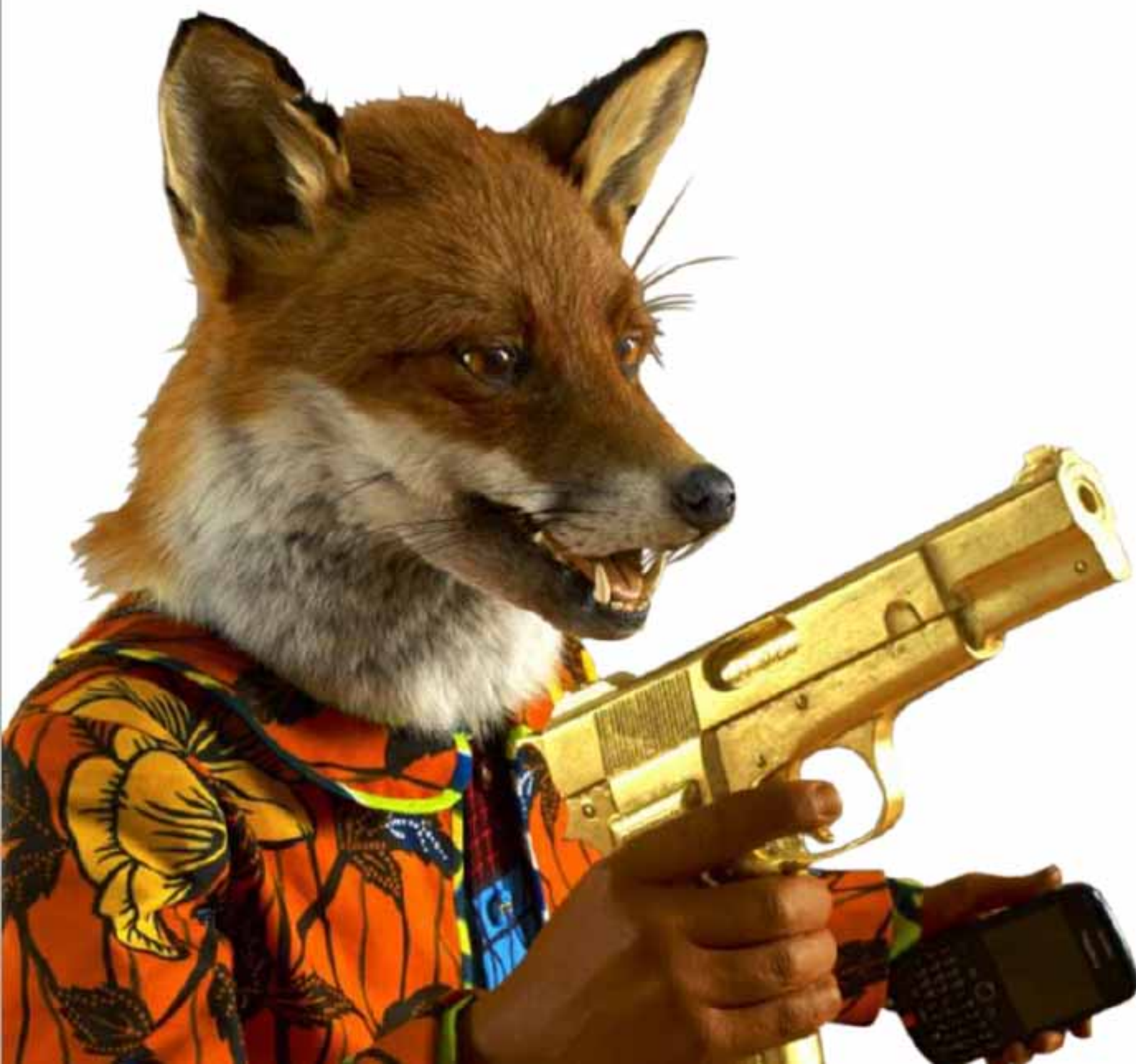
Revolution Kid (Fox), 2012 by Yinka Shonibare MBE Courtesy the artist and Collection Museum Beelden aan Zee, Den Haag- Scheveningen (The Netherlands)

The Bank supports performing arts in partnership with Terra Kulture. This partnership was to support and build talents in stage performance.