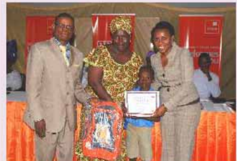
A recipient of the Orange Excellence Awards at St. Georges Boys receiving his certificate.

Our annual Orange Excellence Awards held in four of our adopted schools. This Scholarship award aims to promote intellectual excellence amongst students in our adopted schools. The award is open to students with best overall aggregates. The scholarship applied to tuition payment, textbooks and uniform purchase and payment of examination fees.