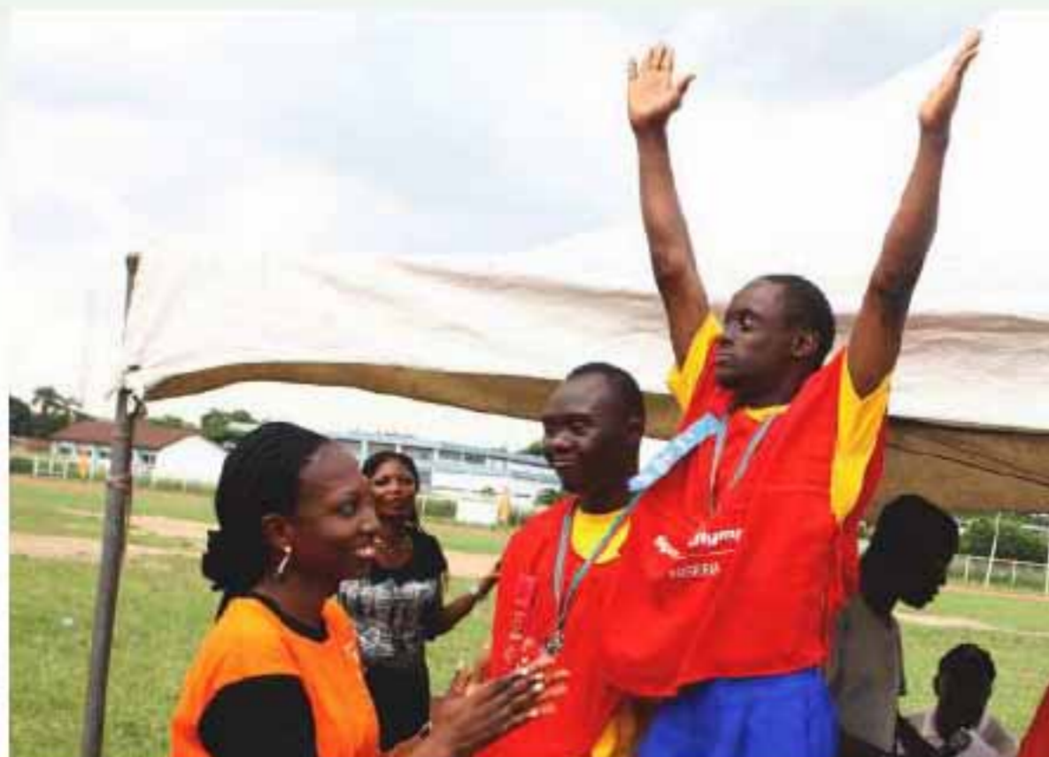
Right: Director of Special Olympics, Nigeria, Victor Osibodu, welcoming athletes from the 2011 Special Olympics World Summer Games in Greece