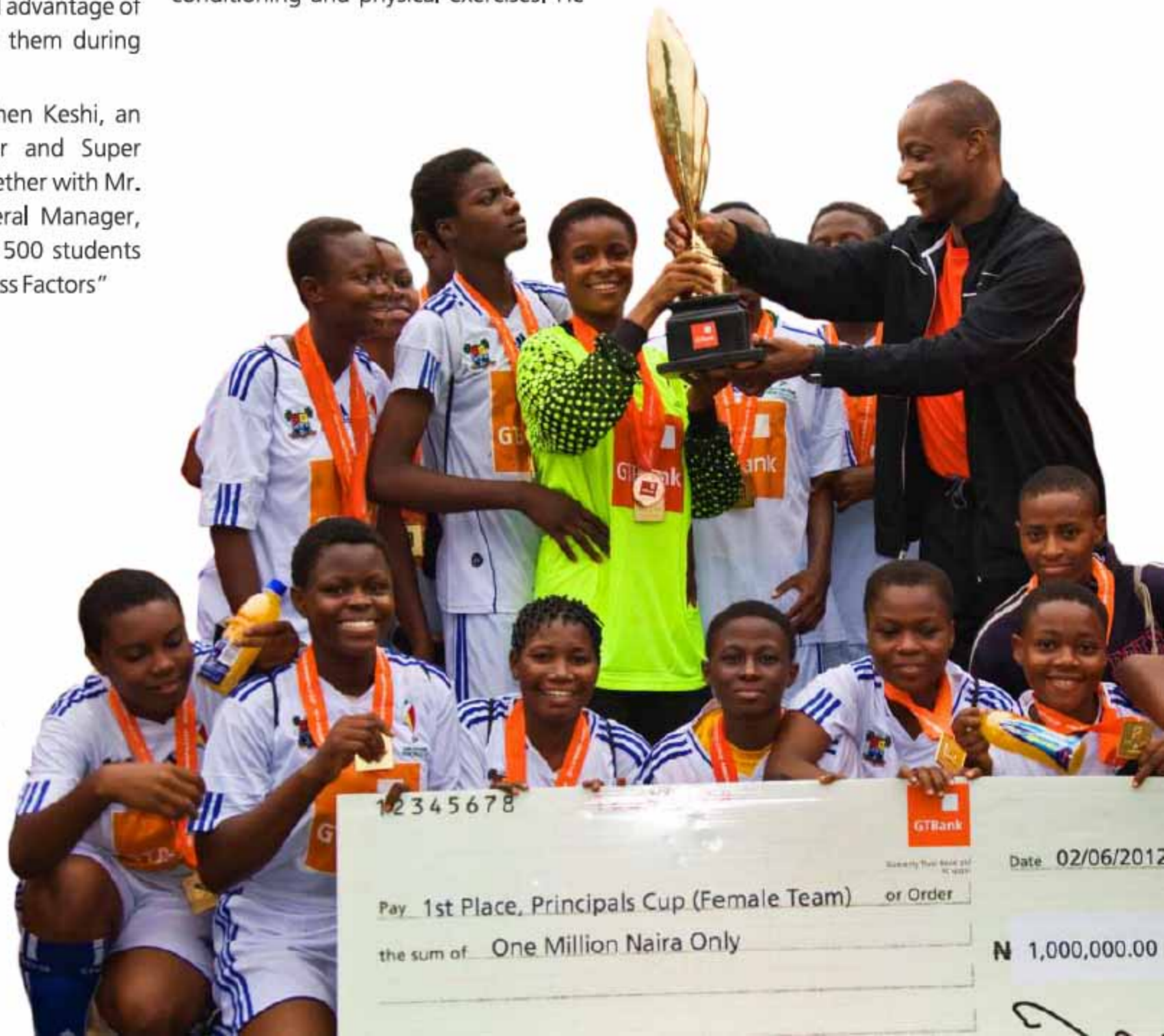
The 2012 female winners of the Lagos State - GTBank Principals Cup - Kuje Senior Secondary School as the MD GTBank hands them their trophy