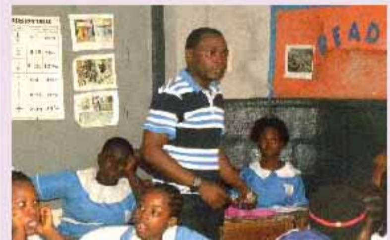
A GTBank volunteer staff taking a class during the Orange After-School Preparatory Classes.