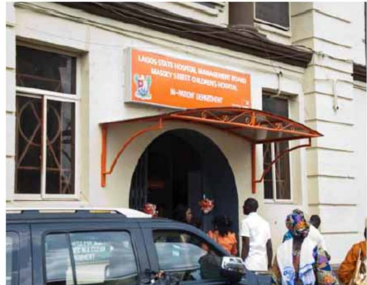
Massey Street Children's Hospital. Before and after the renovations.

W e have a long standing commitment to the communities in which we operate. Beyond the benefits our core business brings to our host communities, we aim to encourage social and economic opportunities through community investment activities.